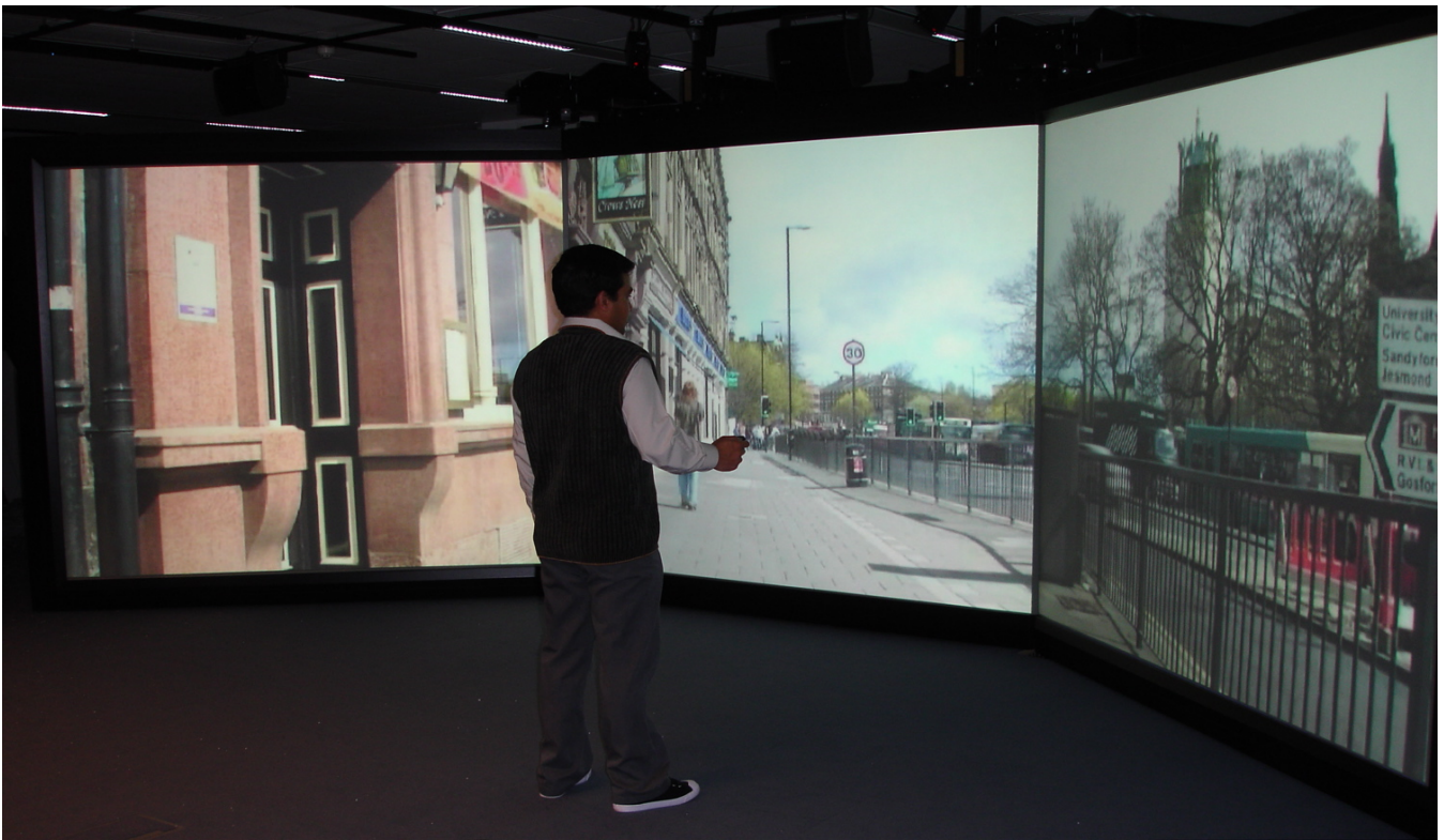
Figure 4: Immersive video in action: a user interacting with a mobile device while being surrounded by a video replay of the location, where it is intended to be used

tooth indoor positioning, RFID e-ticketing and infrared beacons for pointing gestures. The actual application works in following manner: when a user arrives at metro station the PDA detects the platform using Bluetooth positional sensing and displays a map of the platform with directions to the escalator and lift. As the user exits the metro station a GPS signal is detected and a map of surrounding area is displayed with direction information towards the museum. A panoramic photograph (covering a 360° view) at the top of the display is used to help the user identify the direction he or she needs to walk.